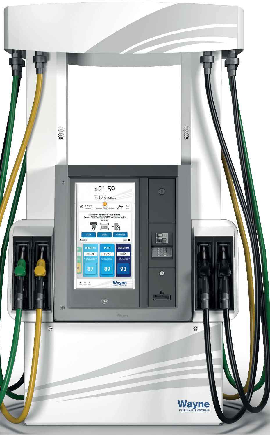
Wayne Ovation® Multi-hose fuel dispenser